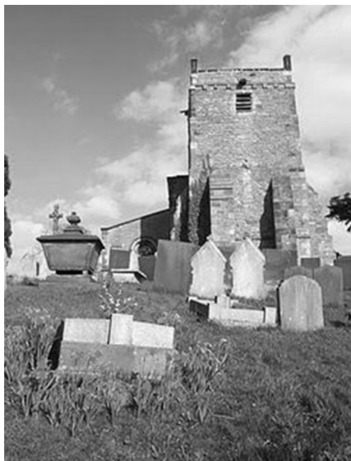
St Mary's Church, Tissington, Derbyshire.